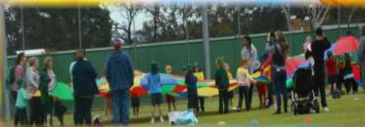
Children and parents all enjoyed the day at the OTH Primary School Sports Day.